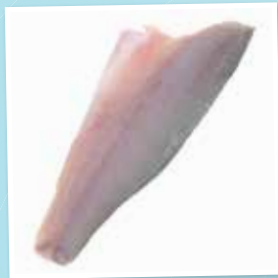
FS1023 Seabass Fillets 90-120 g Pin bones out 3 kg Case €15.65/ £13.53 per kg