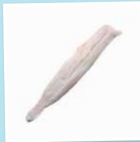
FS990 Hake Skin on 600-1200g PBO €11.50/ £9.94 per kg