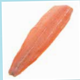
FS988 Salmon Sides Skin on Pinned 1.4 - 1.7 kg 6 kg €12.79/ £11.06 per kg