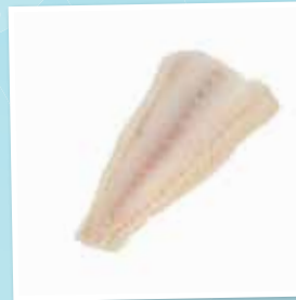
FS691 Cod Fillets Skin On PBI 800-1200 g, 6 kg Case €12.50/ £10.81 per kg