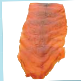
FS058 Dalys Sliced Smoked Salmon 700 - 900g €19.99 / £18.09 per kg