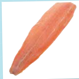
FS988 Salmon Sides x 4 Skin On, Pinned 1.4-1.7kg Per Side €12.79 / £11.57 per kg