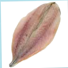
FS639 Mackerel Fillets (Skin on) 160 - 200g 2 kg Tray €6.59 / £5.96 per kg NEW SEASON