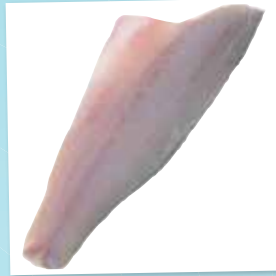
FS1023 Seabass Fillets 90-120g Pin bones out 3 kg Case €15.65 / £14.16 per kg