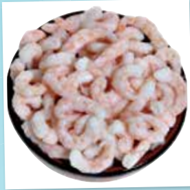
FS235 Prawns Premium in Brine 1.5 kg Tub €16.55 / £14.97 per unit