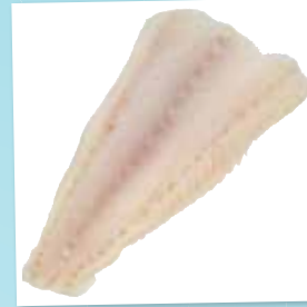
FS691 Cod Fillets Skin On PBI 800-1200g 6 kg Case €11.99 / £10.85 per kg