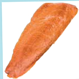
FS222 Portico Smoke Salmon Sliced VacPac Unit of 1.25kg €21.50 / £19.45 per kg