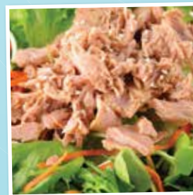
FS194 Tuna Chunks In Brine Pouch 10 x 1.025 kg €56.00/ £50.67 per Case €5.46/ £4.94 per kg No Waste!