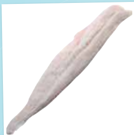
FS932 Hake Fillets (Skin on) 330 - 500g 5 kg Tray €10.50/ £9.50 per kg Descaled Irish West Coast Hake