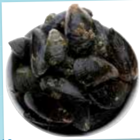
FS210 Mussels (Rope) 5 kg Bag €2.49/ £2.25 per kg