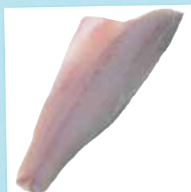
FS1023 Seabass Fillets 90-120g Pin bones out 3 kg Case €15.65/ £14.16 per kg