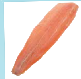
FS988 Salmon Sides x 4 Skin On,Pinned 1.4 - 1.7kg Per Side €11.99 / £10.85 per kg