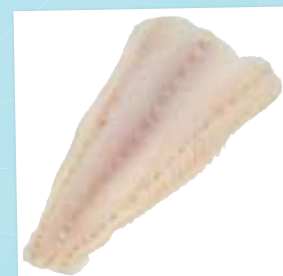
FS691 Cod Fillets Skin On PBI 800-1200g 6 kg Case €11.25 / £10.18 per kg